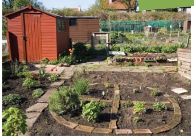
Allotment Garden in Edinburgh

Information about community gardens can easily be found via the internet. Contact your local council to find out about community gardens in your area.