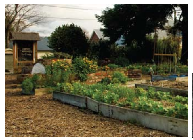
Opawa Community Garden

Information about community gardens can easily be found via the internet. Contact your local council to find out about community gardens in your area.